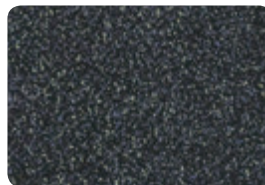
4623-38 GRAPHITE NEBULA